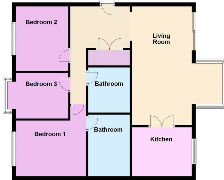
SKETCH PLAN FOR ILLUSTRATIVE PURPOSES ONLY All measurements are approximate. Plan produced using PlanUp.